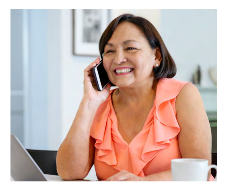
materials in a different language, you can call and request that the materials be translated in the language you read at no cost to you.

We have associates who speak Spanish available to help you. We also use interpreters for any other language you may need. Our written materials are available in many languages and formats. If you need these